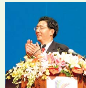
中国广西壮族自治区 人民政府常务副主席 郭声琨 H. E. Guo Shengkun Executive Vice Governor of Guangxi Zhuang Autonomous Region, China