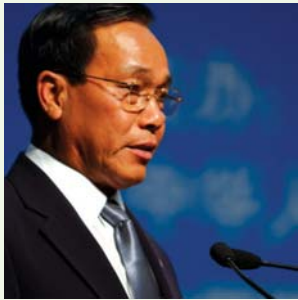
缅甸总理 梭温 H. E. Soe Win Prime Minister of Myanmar

State Leaders and Representative of the ASEAN Secretariat at the Opening Ceremony