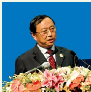
中国—东盟商务与投资峰会 组委会主任、中国国际贸易 促进委员会会长 万季飞 H. E. Wan Jifei Chairman of the Organizing Committee of CABIS and CCPIT