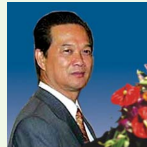
越南副总理 阮晋勇 H. E. Nguyen Tan Dung Deputy Prime Minister of Vietnam