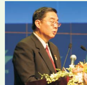
东盟秘书处秘书长 王景荣 H. E. Ong Keng Yong Secretary-General of the ASEAN