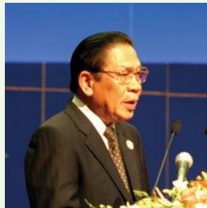
老挝副主席 朱马里·赛亚颂 H. E. Choummaly Saynasone Vice President of Laos