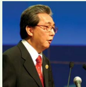
泰国第一副总理 颂奇 H. E. Somkid Jatusripitak Deputy Prime Minister of Thailand