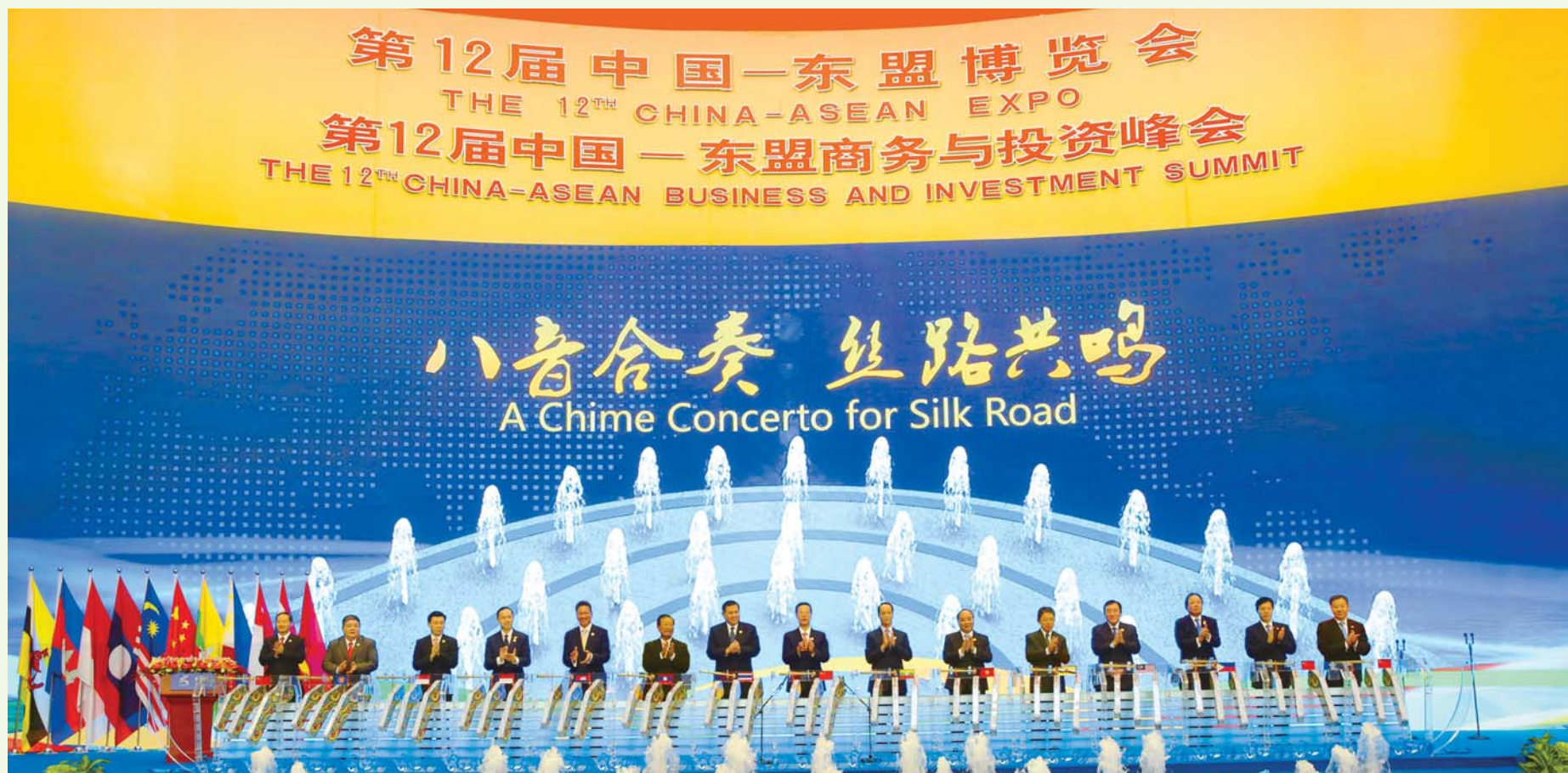
开幕大会 Opening Ceremony