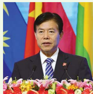
中国商务部国际贸易谈判代表兼 副部长钟山 H. E. Zhong Shan International Trade Representative and Vice Minister of Commerce of China