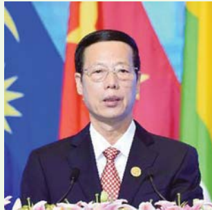
中国副总理 张高丽 H. E. Zhang Gaoli Vice Premier of China

State Leaders and Representatives of the ASEAN Secretariat and International Organization at the Opening Ceremony