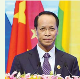
缅甸副总统 赛茂康 H. E. Sai Mauk Kham Vice President of Myanmar