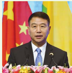
世界贸易组织副总干事 易小准 H. E. Yi Xiaozhun Deputy Director-General of the World Trade Organization