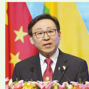
特邀贵宾国韩国产业通商资源部 副部长文在焄 Mr. Woo Teahee Deputy Minister of Industry Trade Resources of Korea and representative of Special Guest Country of CAEXPO