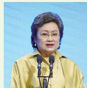
泰国商业部部长 阿披拉迪·丹达蓬 H. E. Apiradi Tantraporn Minister of Commerce of Thailand