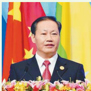
中国广西壮族自治区党委书记、 人大常委会主任彭清华 H. E. Peng Qinghua Secretary of the CPC Guangxi Committee and Chairman of Guangxi People's Congress, China