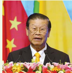
老挝副总理 宋沙瓦 H. E. Somsavat Lengsavad Deputy Prime Minister of Laos