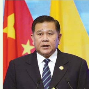
泰国副总理、总理特使 塔纳萨·巴迪玛布拉功 H. E. General Dr. Tanasak Patimapragorn Deputy Prime Minister and Special Envoy of the Prime Minister of Thailand