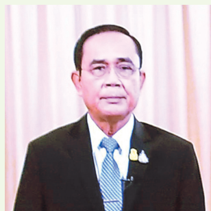
泰国总理 巴育 H.E. Prayut Chan-o-cha Prime Minister of Thailand