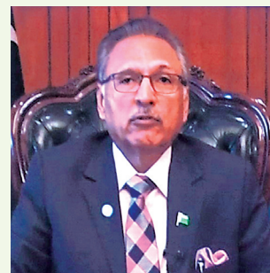
巴基斯坦总统 阿尔维 H.E. Dr. Arif Alvi President of Pakistan