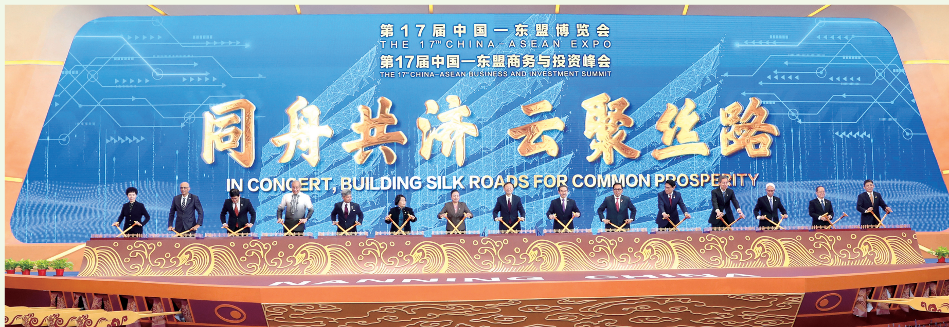
开幕大会 Opening Ceremony