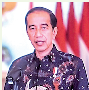
印度尼西亚总统 佐科 H.E. Joko Widodo President of Indonesia