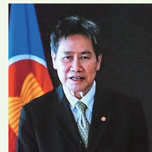
东盟秘书长 林玉辉 H.E. Lim Jock Hoi Secretary-General of ASEAN