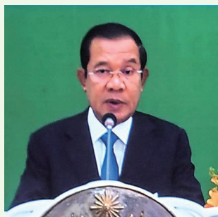
柬埔寨首相 洪森 H.E. Samdech Hun Sen Prime Minister of Cambodia