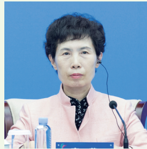
中国—东盟商务与投资峰会组委会 主任、中国国际贸易促进委员会 会长高燕 H.E. Ms. Gao Yan Chairperson of the Organizing Committee of CABIS and CCPIT