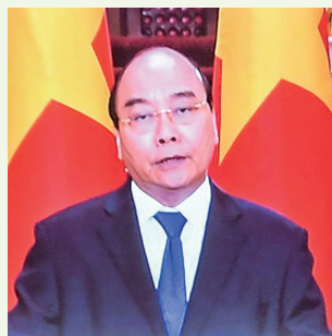
越南总理 阮春福 H.E. Nguyen Xuan Phuc Prime Minister of Vietnam