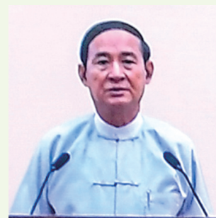
缅甸总统 温敏 H.E. U Win Myint President of Myanmar