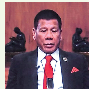
菲律宾总统 杜特尔特 H.E. Rodrigo Roa Duterte President of the Philippines