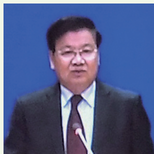
老挝总理 通伦 H.E. Thongloun SISOUITH Prime Minister of Laos